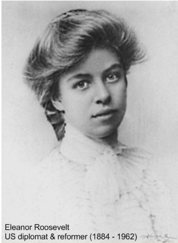
Eleanor Roosevelt US diplomat & reformer (1884 - 1962)

"The Future Belongs to those Who Believe in the Beauty of Their Dreams"