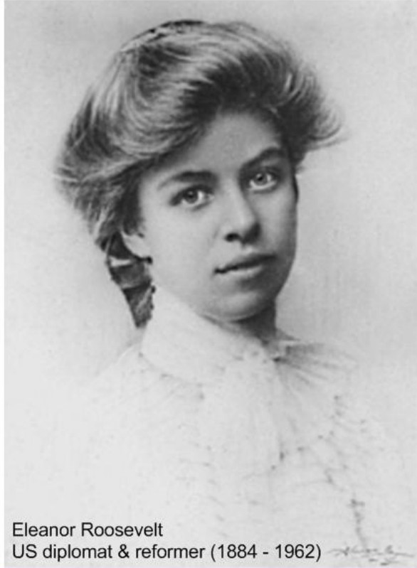
Eleanor Roosevelt US diplomat & reformer (1884 - 1962)

"The Future Belongs to those Who Believe in the Beauty of Their Dreams"